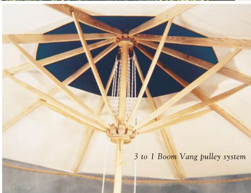
3 to 1 Boom Vang pulley system