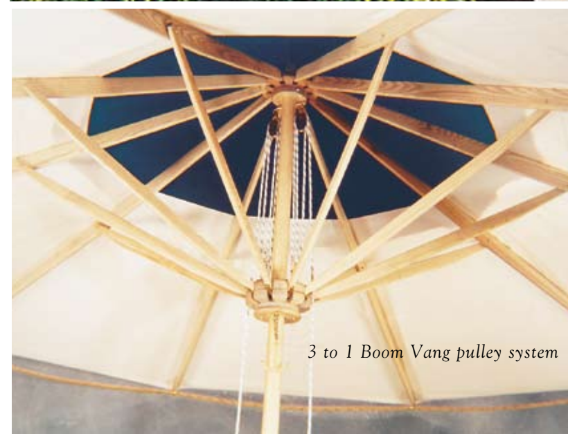
3 to 1 Boom Vang pulley system