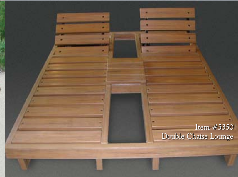
Item #5350 Double Chaise Lounge