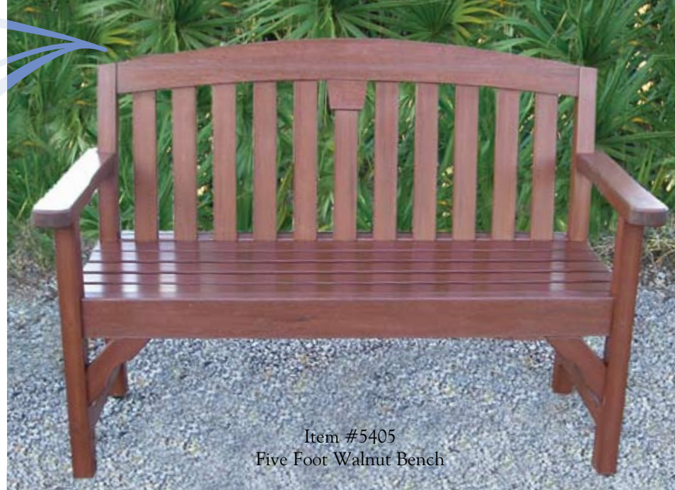
Item #5405 Five Foot Walnut Bench