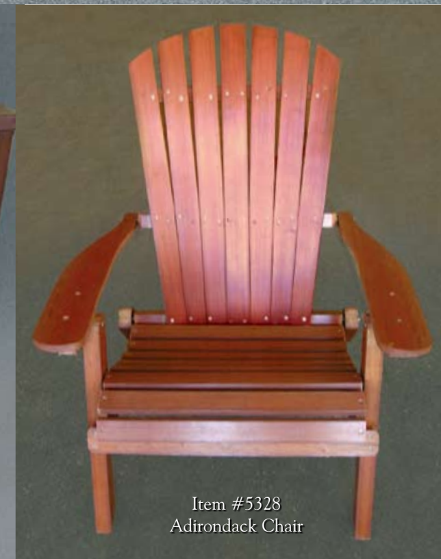
Item #5328 Adirondack Chair