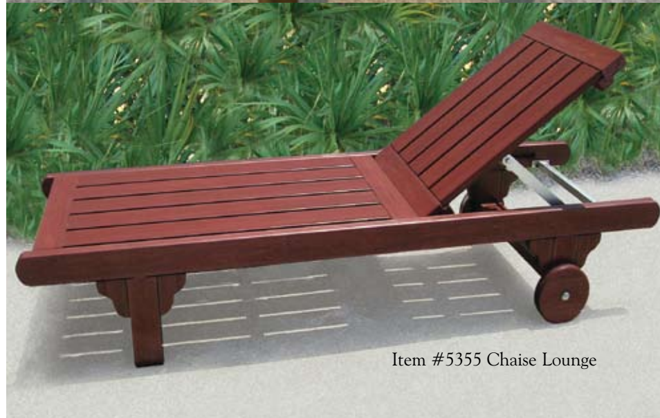
Item #5355 Chaise Lounge