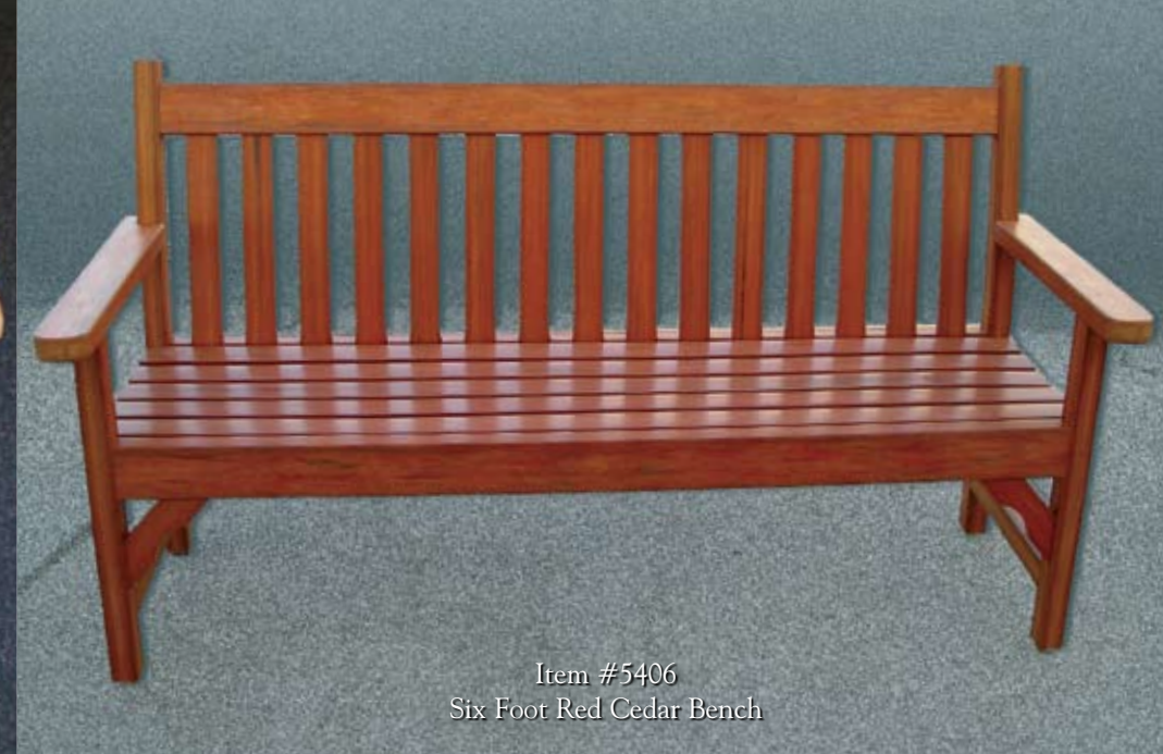
Item #5406 Six Foot Red Cedar Bench