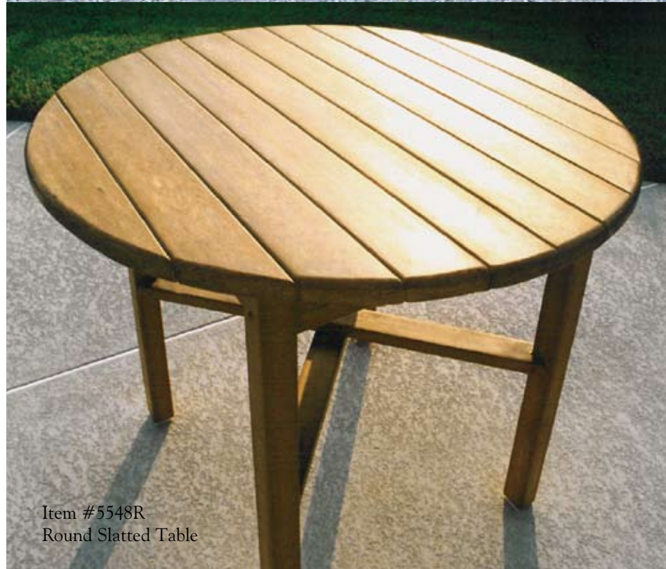
Item #5548R Round Slatted Table