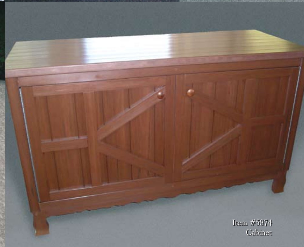
Item #5874 Cabinet