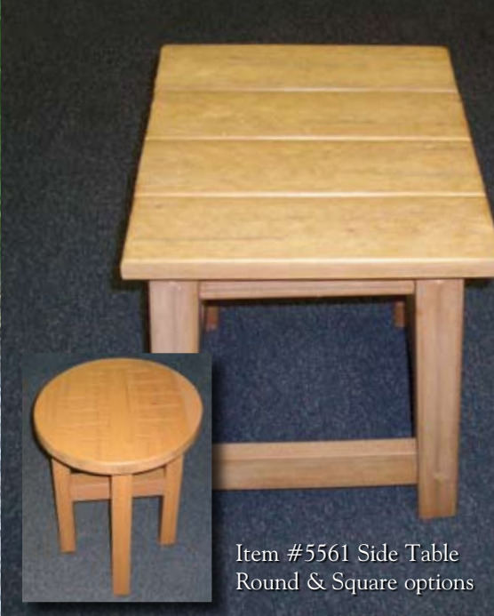
Item #5561 Side Table Round & Square options