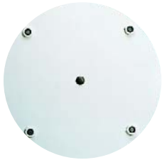
#602 57 LBS. 24 1/2" DIA. 3/8" THICK