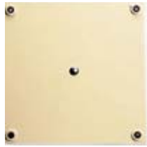
#601 71 LBS. 21 3/4" SQ. 1/2" THICK