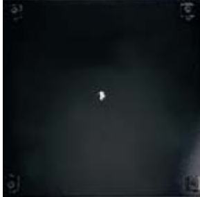
#603 138 LBS. 30" SQ. 1/2" THICK