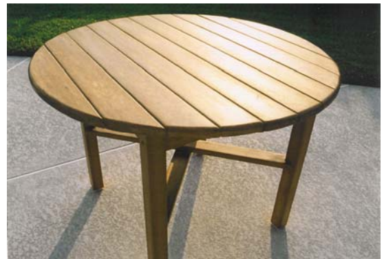
Item# 5548R Round Slatted Table