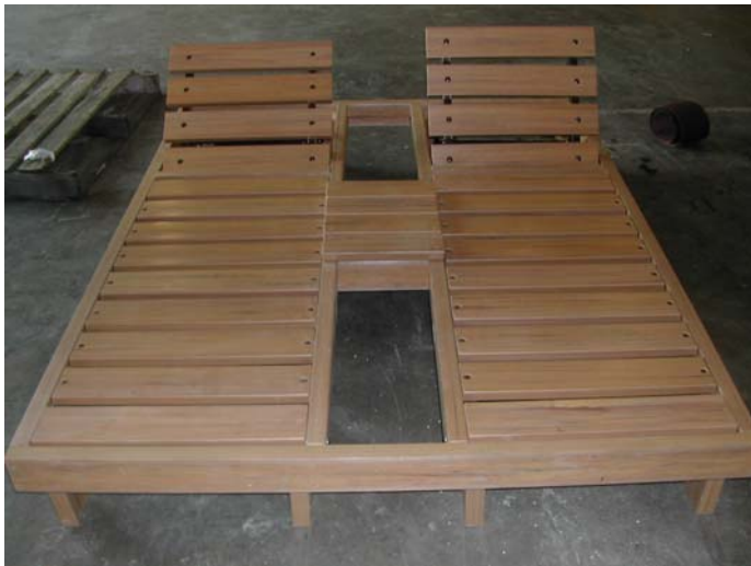
Item# 5350 Double Chaise Lounge