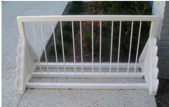
Item# 5879 Bicycle Rack