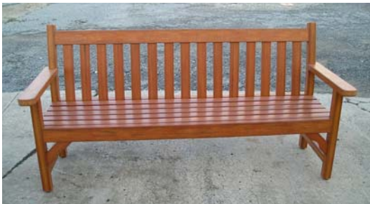
Item # 5406 6' Red Cedar Bench