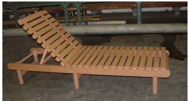
Item# 5355 Chaise Lounge