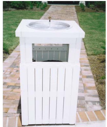
Item #5800 Waste Receptacle