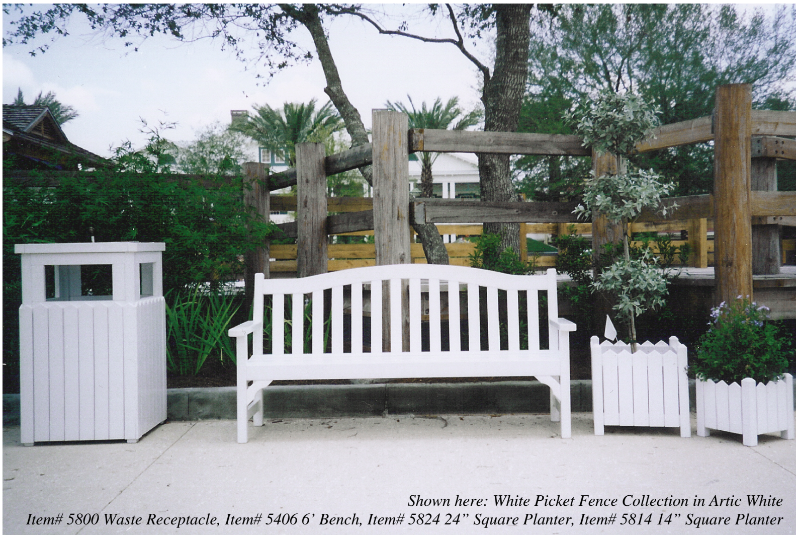
Shown here: White Picket Fence Collection in Artic White Item# 5800 Waste Receptacle, Item# 5406 6' Bench, Item# 5824 24" Square Planter, Item# 5814 14" Square Planter