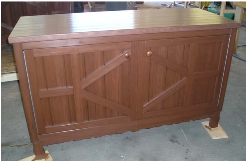
Item# 5874 Cabinet