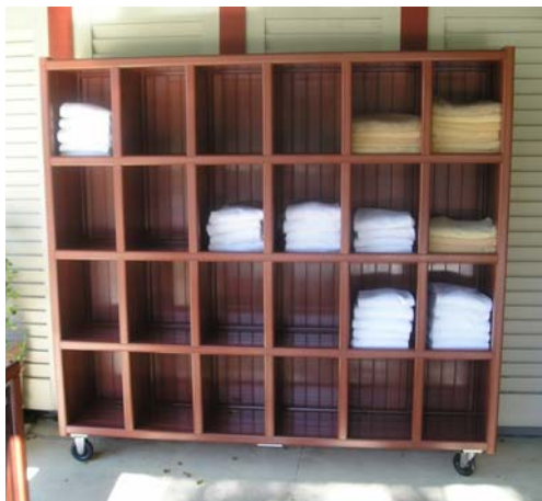
Item#5858 Towel Distribution Bin

*Colors shown are as accurate as possible. Actual color may vary slightly from color chart shown. Contact your sales representative for samples.