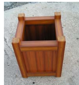
Item# 5814 Square Planter