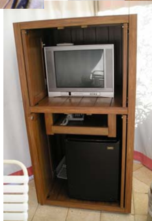
Item# 5875 TV Cabinet closed (above) open (left)