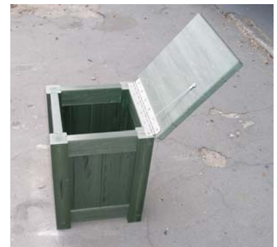
Item# 5872 Divot Box