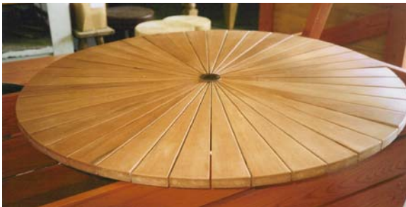
Item# 5536R Round Table Top