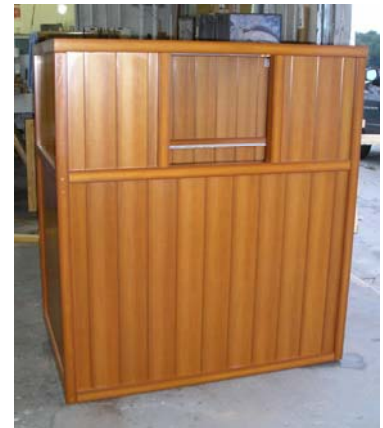
Custom Laundry Bin Cover