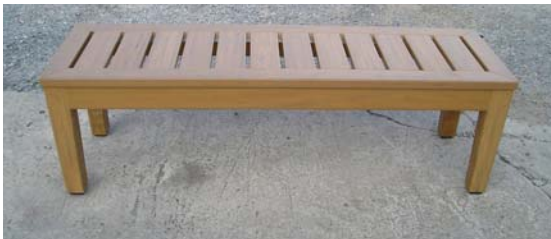
Item# 5415 5' Slatted Backless Bench