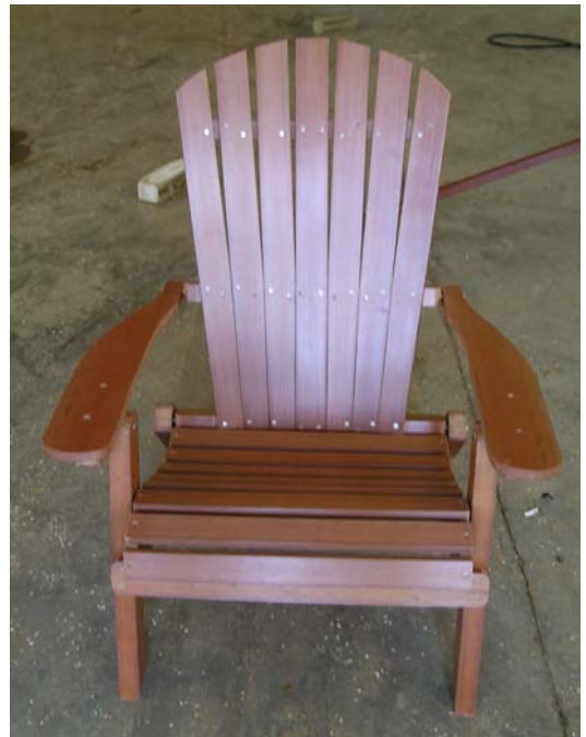
Item# 5328 Adirondack Chair