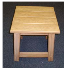
Item# 5561 Square Side Table