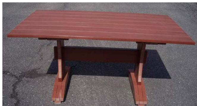
Item# 5540 Rectangle Table (end view and side view)