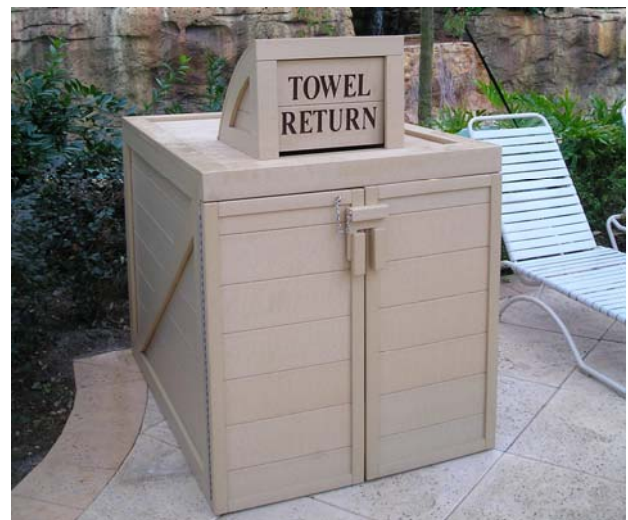
Item# 5859 Towel Return Bin