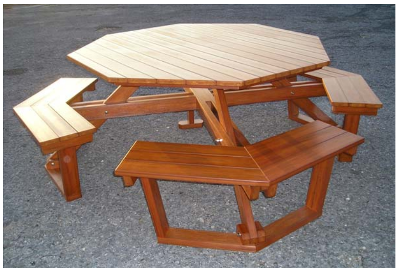
Item# 5548A Red Cedar Octagonal Picnic Table