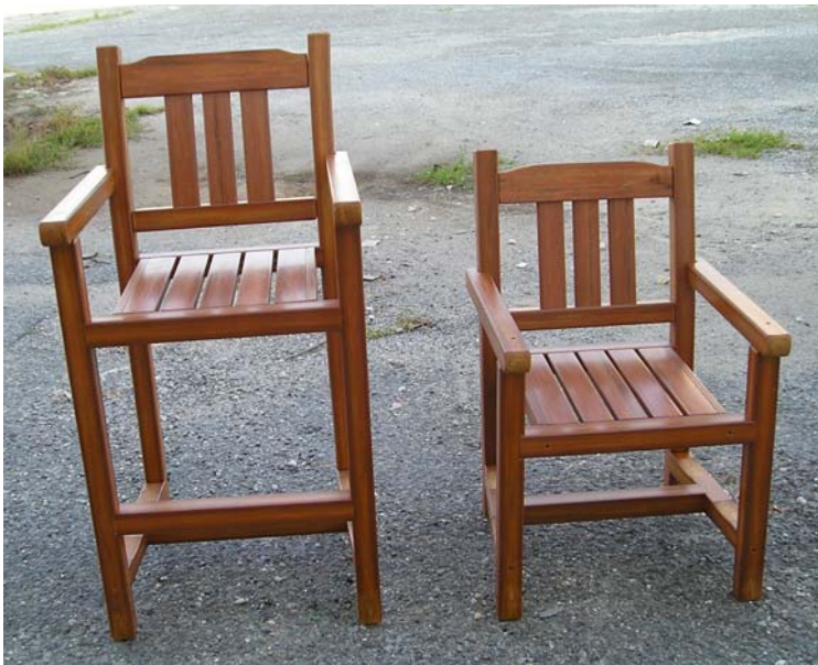
Item# 5320 Red Cedar Bar Chair & Dining Chair