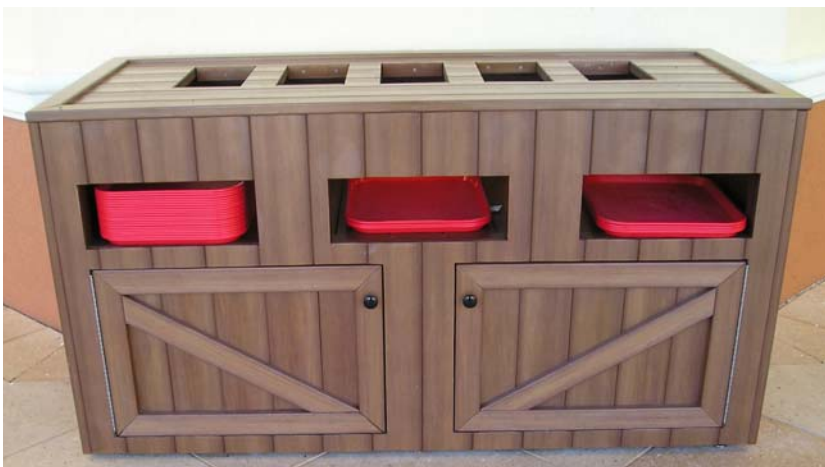
Item# 5876 Tray Receptacle/Condiment Stand