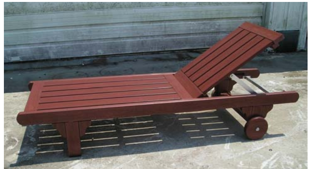
Item# 5355 Chaise Lounge