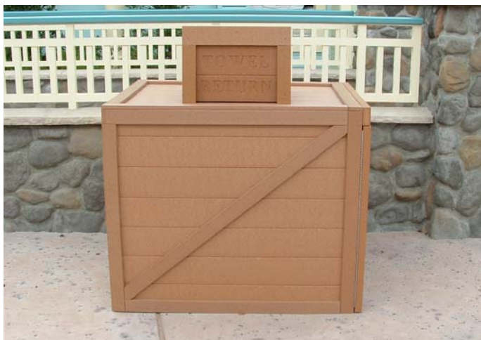
Item# 5859 Towel Return Bin