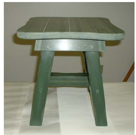
Item# 5315 Stool