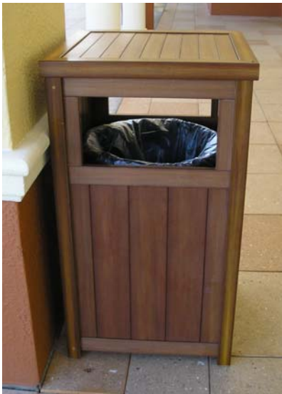
Item #5800 Waste Receptacle