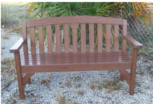
Item# 5405 5' Walnut Bench