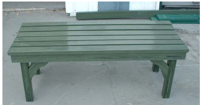
Item# 5414 4' Backless Bench