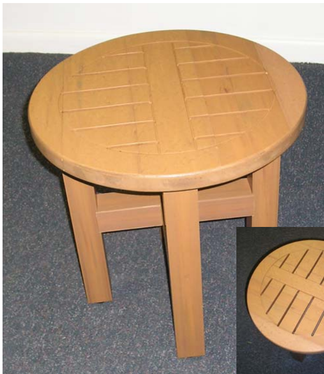
Item# 5561 Round Side Table