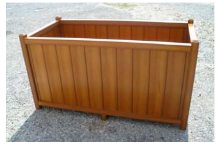
Item# 5836 Rectangle Planter