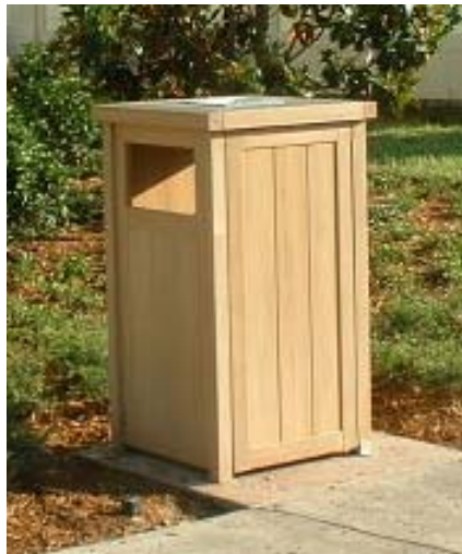
Item #5800 Waste Receptacle