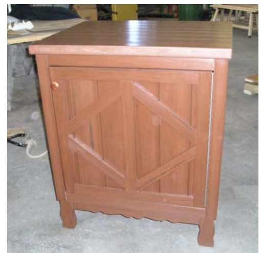
Item# 5874 Cabinet