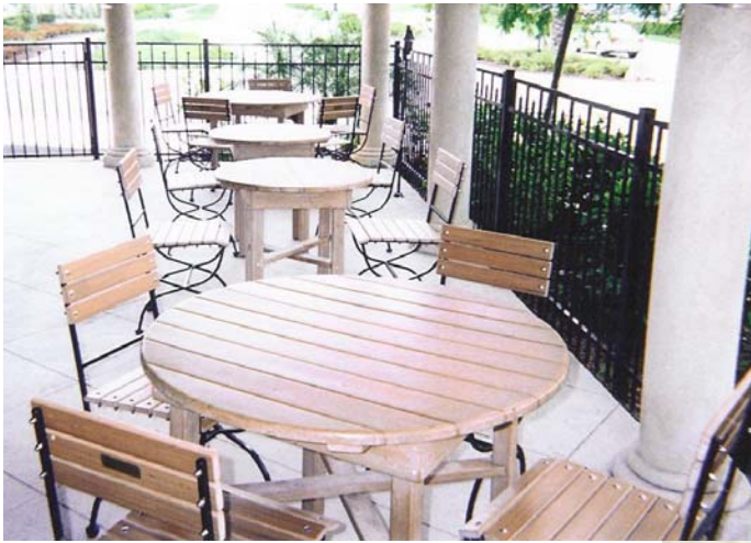
Item# 5323 Bistro Table & Chairs