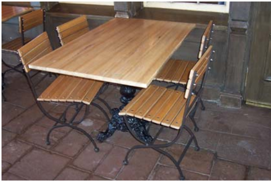
Item# 5323 Bistro Table & Chairs