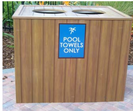
Item# 5859 Towel Return Bin